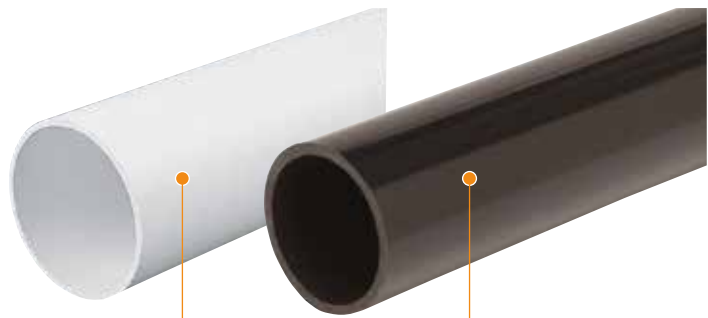
Light and heavy gauge options

REASSURINGLY RECYCLED OUR WHITE CONDUIT LENGTHS ARE MANUFACTURED USING OVER 95% RECYCLED MATERIAL.