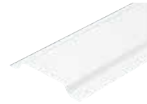
Channel (white only)